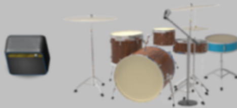
ZACH Drummer 4 piece Plus Side snare Plus Vocal