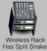
Wireless Rack Has Split Snake